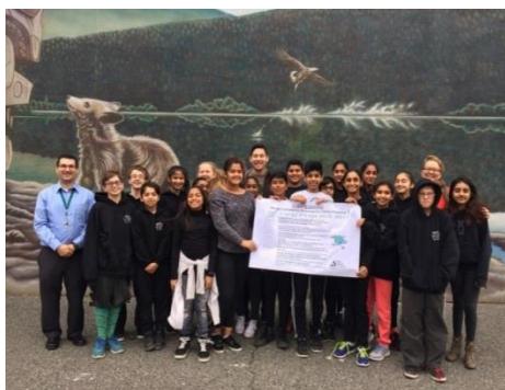
Gibson Elementary 2016-2017