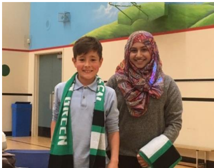
Pebble Hill Elementary